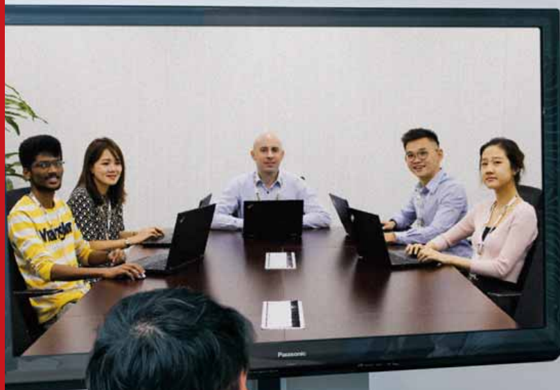
Teleconference between our global site and office in Japan